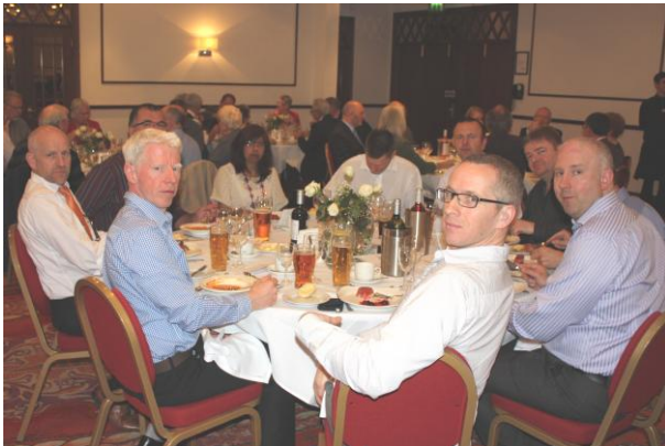
YORK MINI REUNION 2013