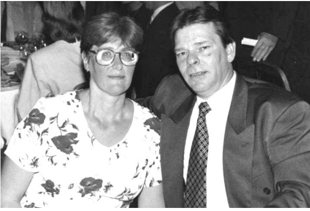
BLACKPOOL REUNION 1995