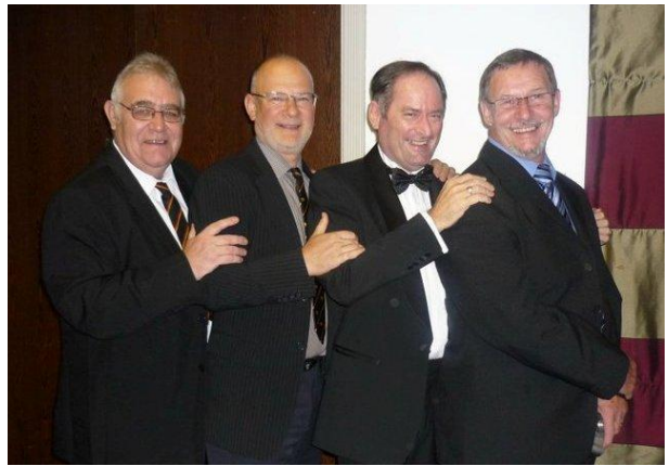
EDINBURGH REUNION 2010