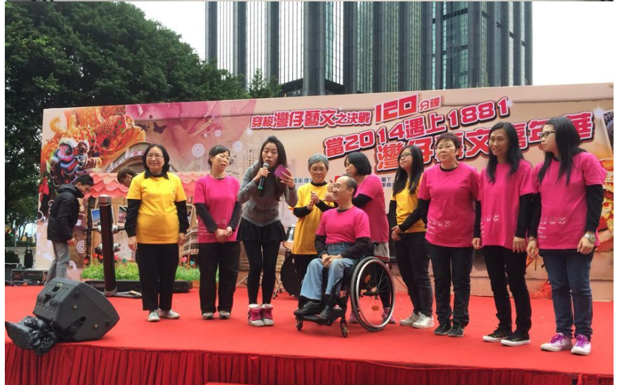
Silencer group of deaf & hearing group