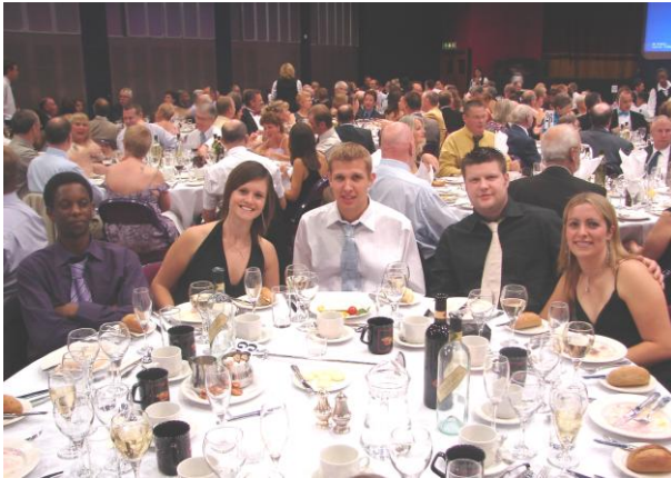
WOKING REUNION 2005