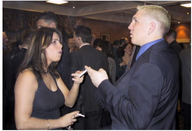
KENILWORTH REUNION 2001